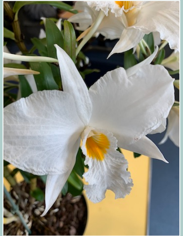
Dendrobium infundibulum 'Phoebe'