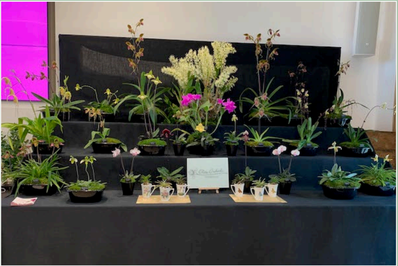
Elite orchids Gold award