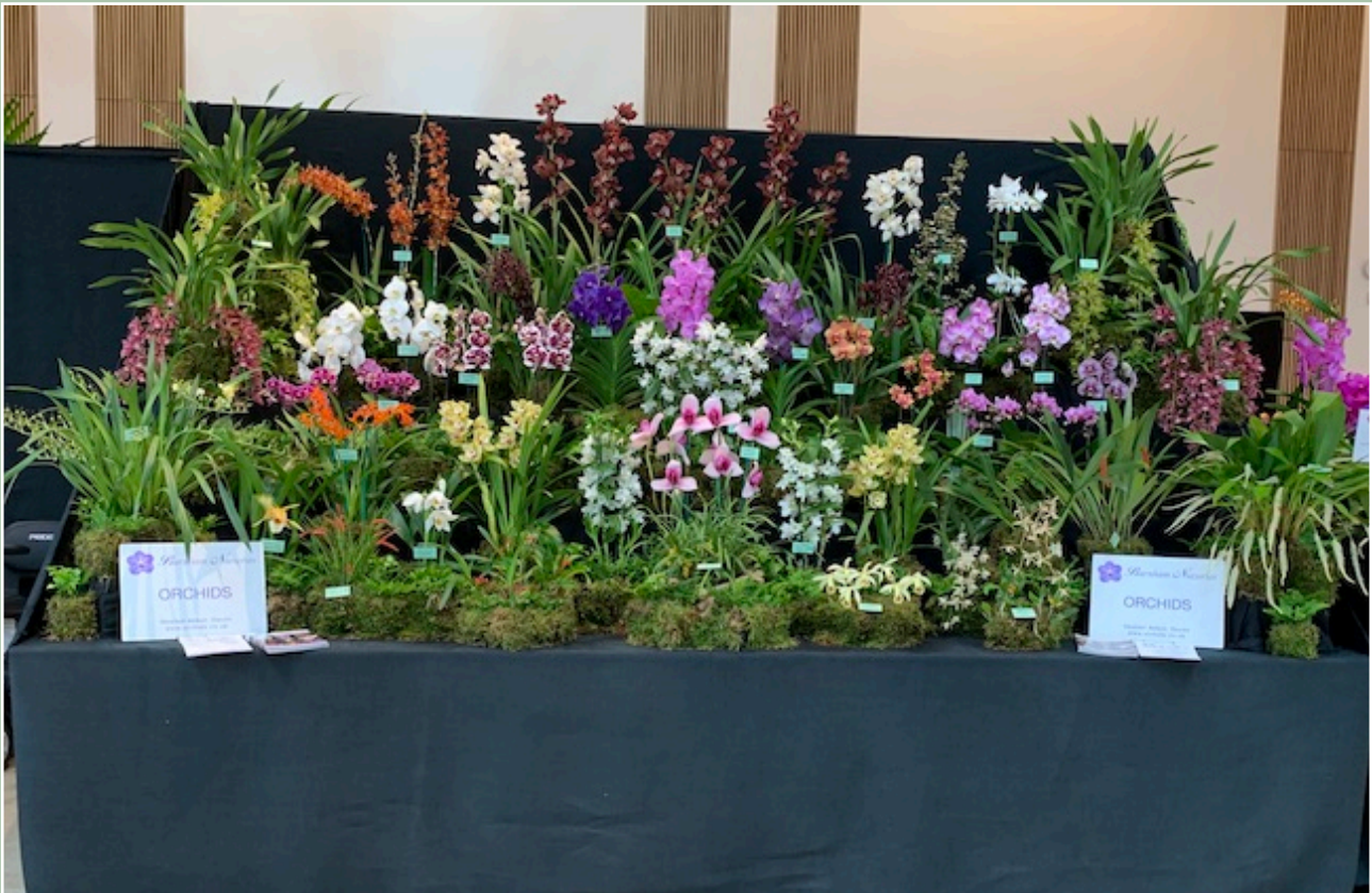
Burnham Nurseries Gold award