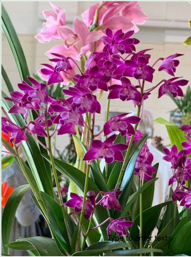
Dendrobium kingianum possibly