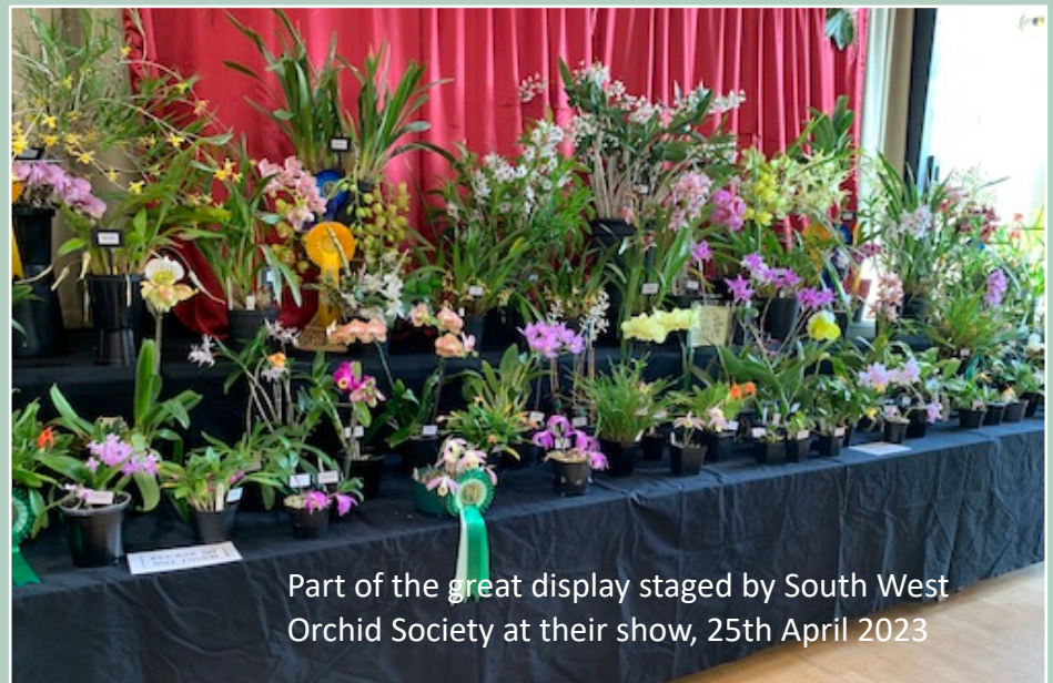
Part of the great display staged by South West Orchid Society at their show, 25th April 2023

In this newsletter, there are photos from the Wisley Orchid Show, 15th - 18th March, a few photos from the RHS Committee Meeting at Bournemouth Show and some from South West Show that was held last Saturday at Monkton Heathfield. This has made quite a long issue this time and there are a few items that have had to be held over till next time: a report on the Kew orchid festival and an article on setting up a terrarium, more of which next time.