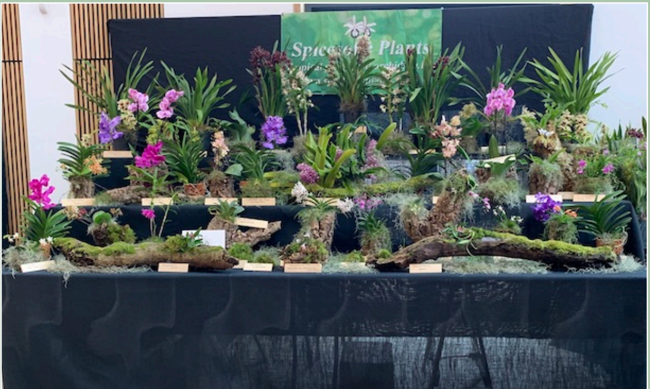
Spicesotic Plants silver-gilt award