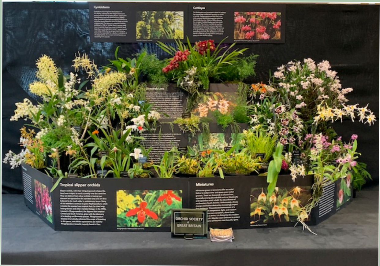
Orchid Society of Great Britain silver award