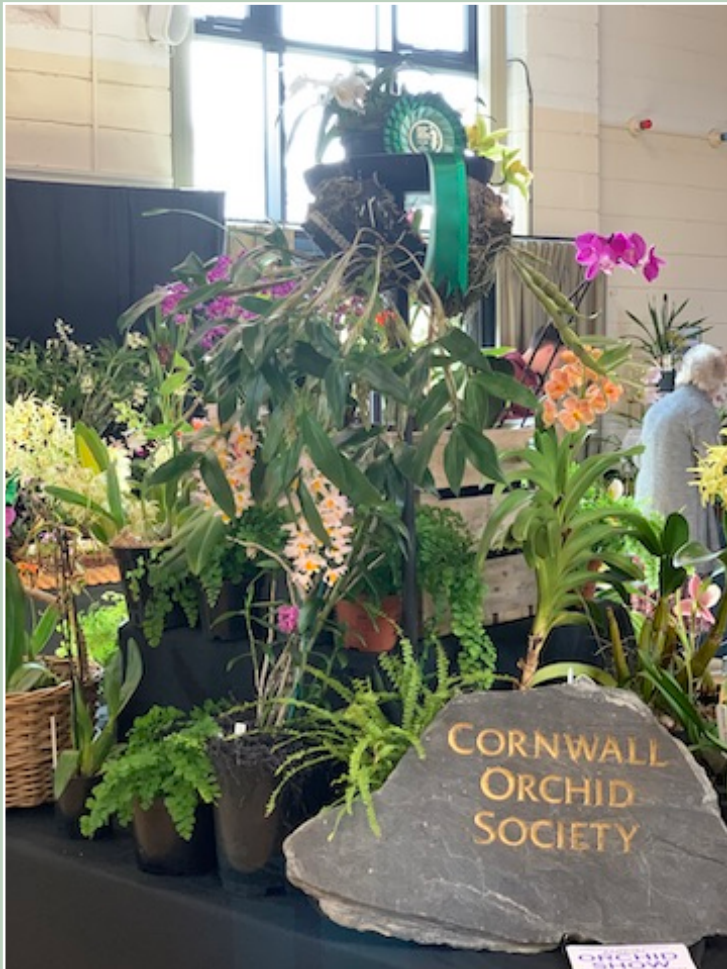
Cornwall Orchid Society display