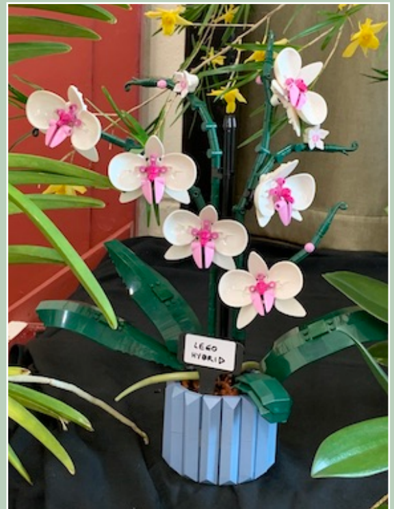
I still can't understand why this didn't get best in show?? Answers on a post card only please!