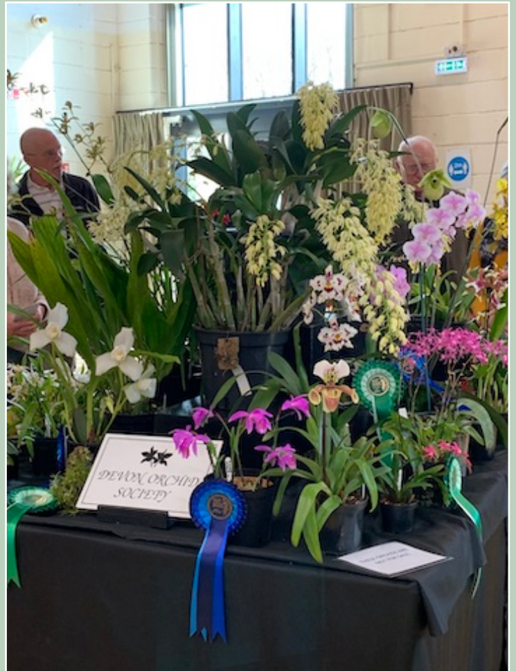
Devon Orchid Society display