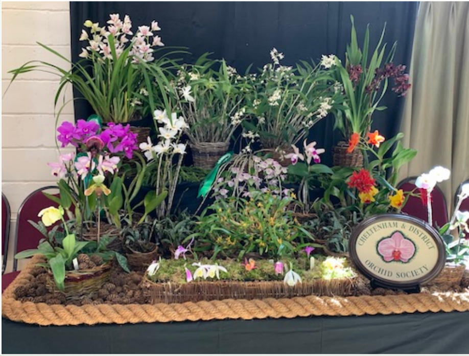
Cheltenham and District Orchid Society display

Well supported by neighbouring societies who all staged lovely displays with some well grown and unusual plants on display. A great friendly show where it was good to meet up with some orchid friends that we hadn't seen for a while. I mustn't forget Burnham Nurseries who represented the trade.