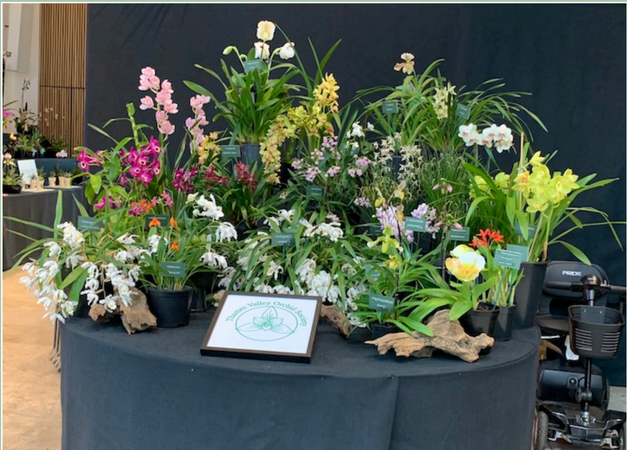
Thames Valley Orchid Society silver award