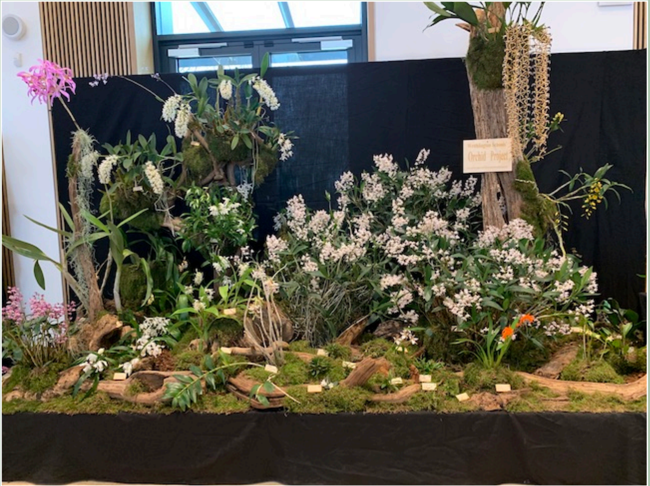
Writhlington School Project silver-gilt award