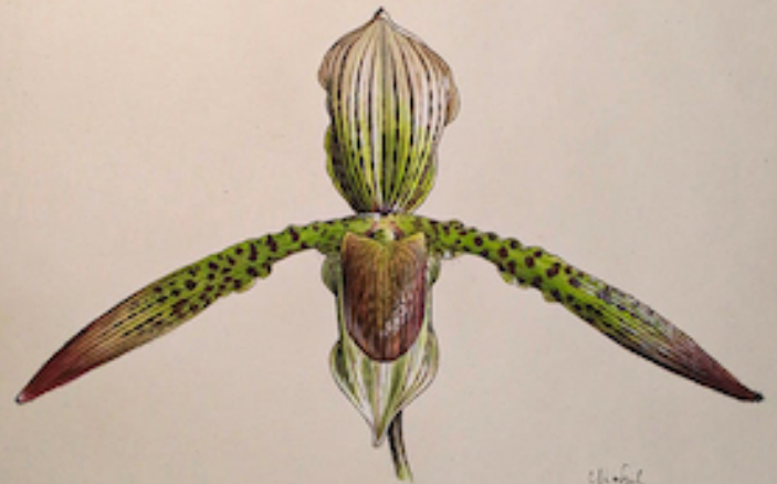
Paphiopedilum Keightoniae 'Hazel' Award of Merit, R. H. S., 20th June, 1995