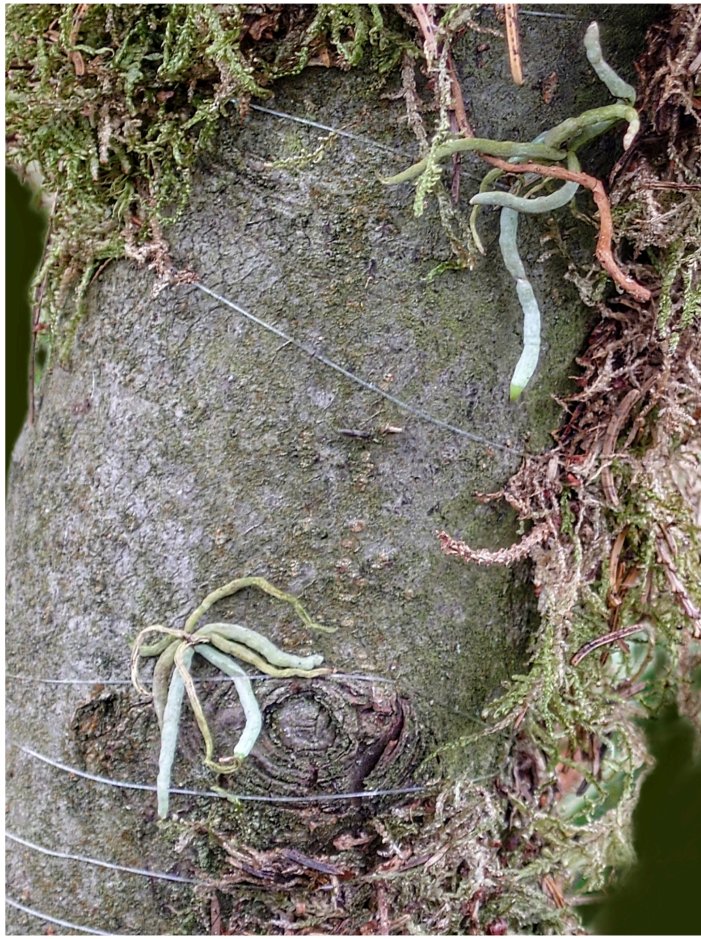
Ghost orchids seedlings at Chelsea

After the Chelsea Flower show the Ghost orchid plant and seedlings were donated to the Royal Botanic Gardens Kew. Unfortunately only the bud had been visible during the show, but a few days ago the bud opened at Kew, as the picture above show.