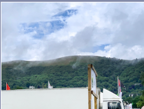
Malvern Hills, from the showground 2019