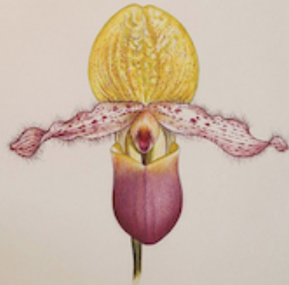
Paphiopedilum glaucophyllum var. mequillianum 'Winchester' Award of Merit, R. H. S., 28th August, 2004