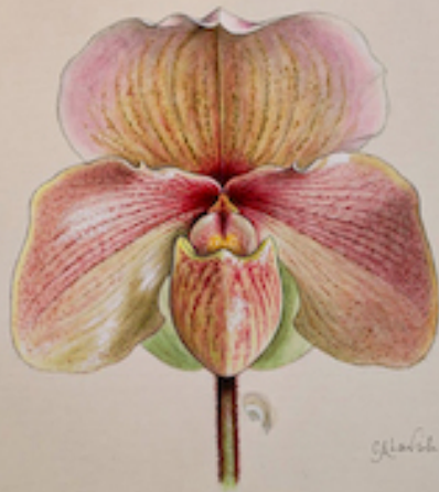
Paphiopedilum Daybreak 'Nouvelle' Award of Merit, R. H. S., 29th January, 1991