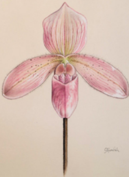
Paphiopedilum Pink Enchantress 'Passionale' Award of Merit, R. H. S., 15th August, 1989