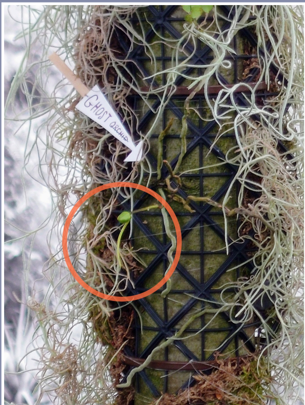
Ghost Orchid - Dendrophylax lindenii

The Orchid Society of Great Britain's Gold medal exhibit at Chelsea this year. Congratulations to everyone who took part - well done guys!