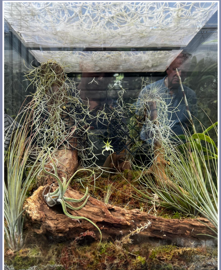
Ghost orchid flowering at Kew, a couple of days ago

They are intending to pollinate it and hopefully eventually obtain seedlings of this Endangered species. Which will help in its conservation.