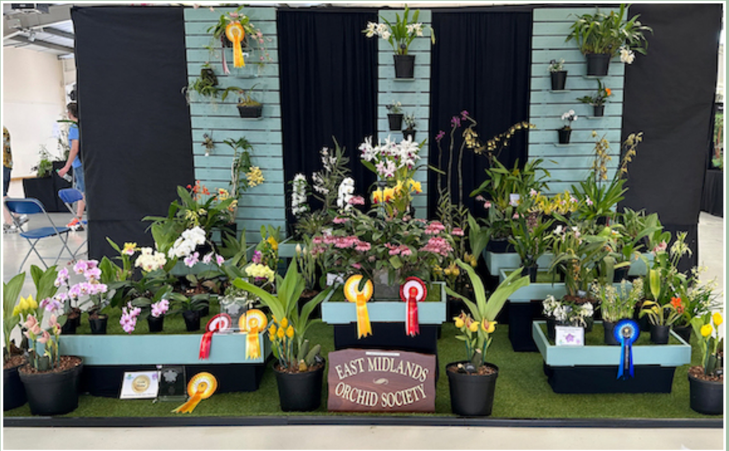
GOLD award and Best Amateur Display East Midlands Orchid Society