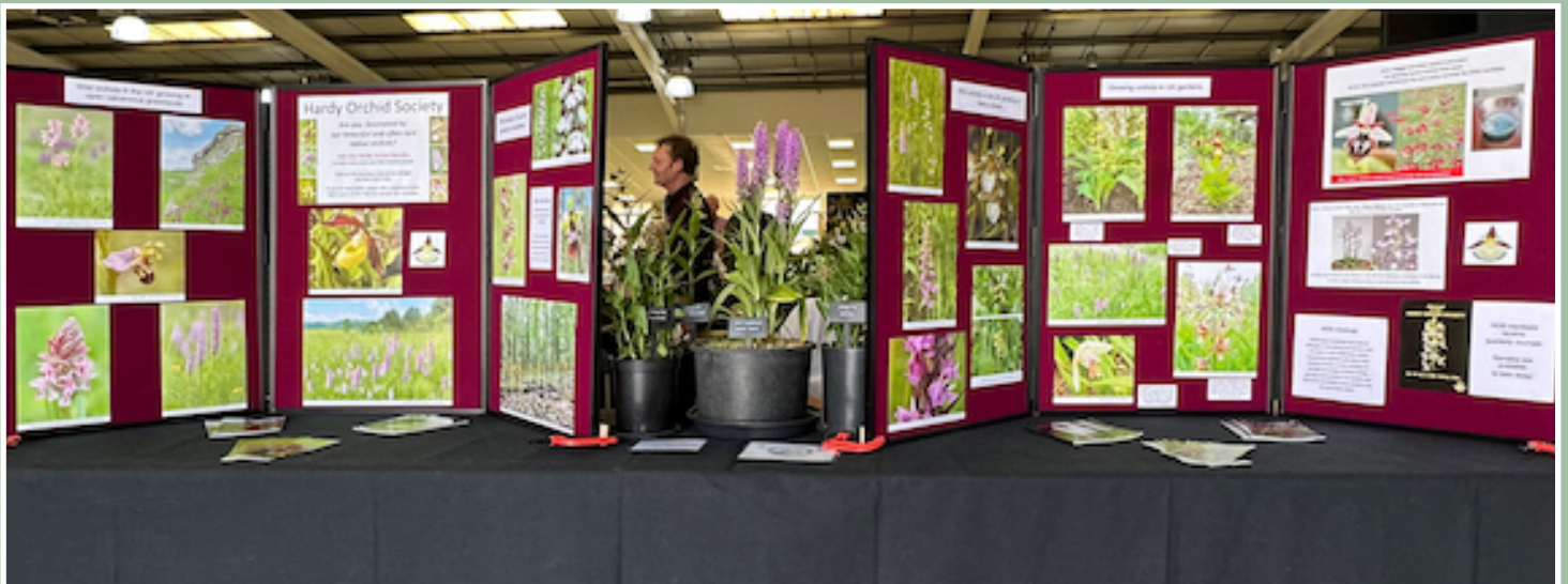
Silver award Hardy Orchid Society

Although the weather was warm all weekend, the wind was sometimes a problem especially here