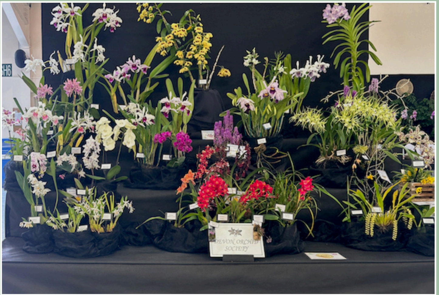
GOLD award Devon Orchid Society