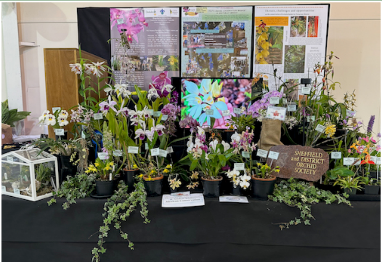
Silver award Sheffield Orchid Society