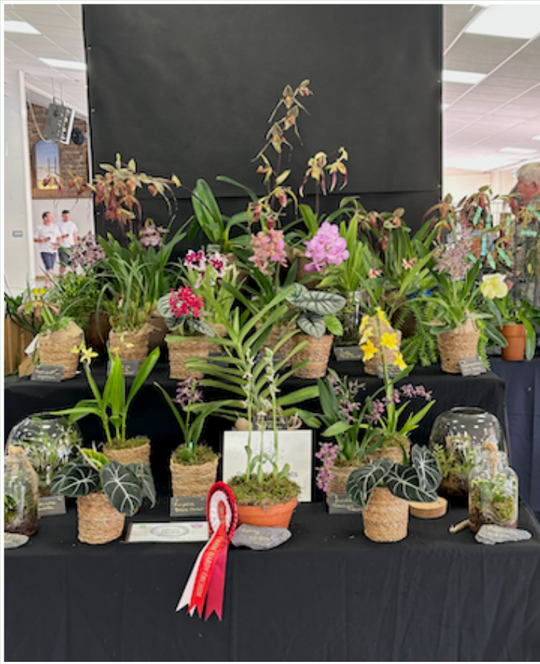
Silver award trade Spicesotics