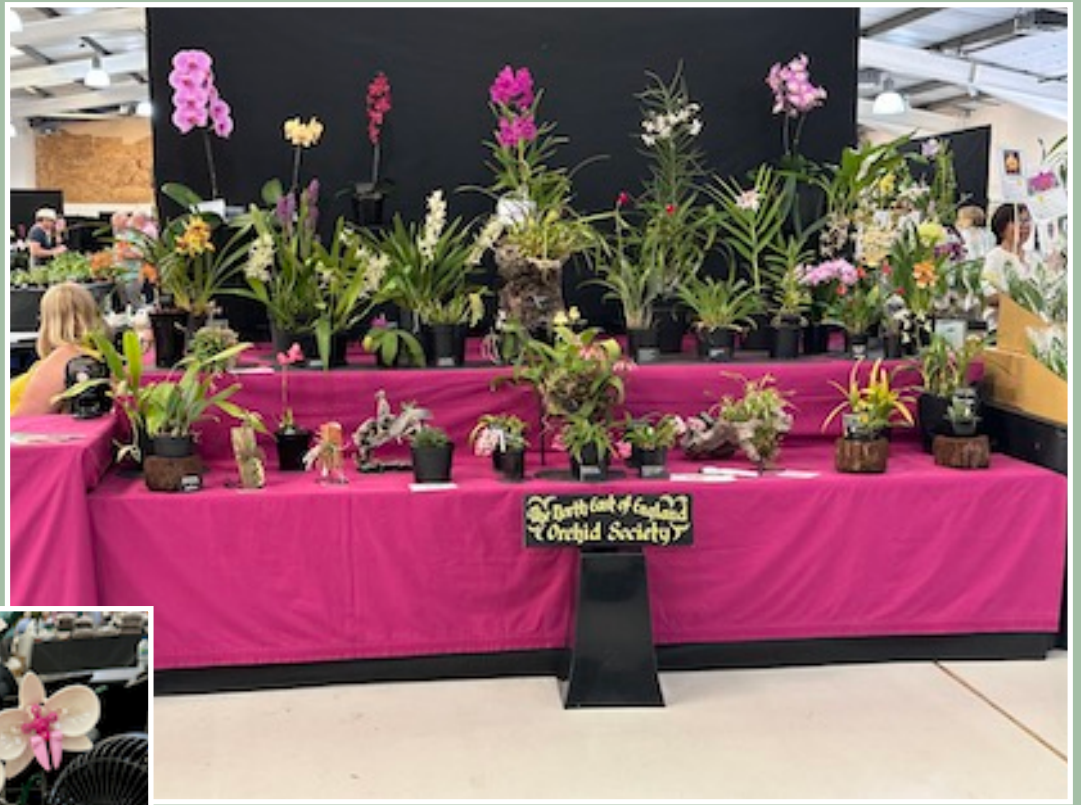
Silver Gilt award North of England Orchid Society