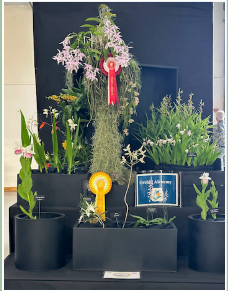
Silver Gilt award Trade Orchid Alchemy