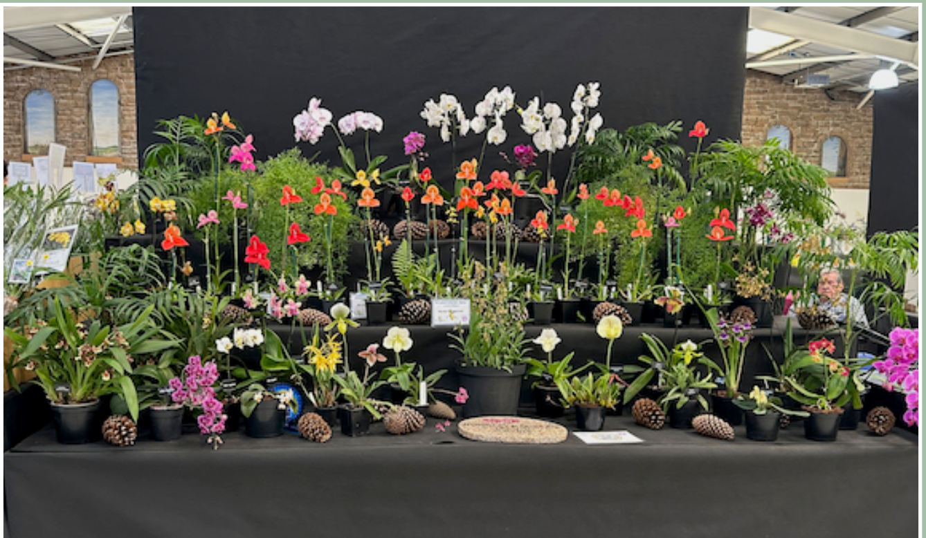
Silver Gilt award Hinckley and District Orchid Society