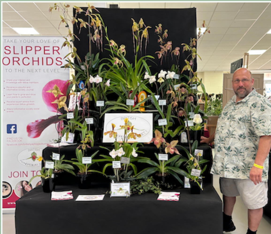
Silver Gilt award trade Elite Orchids