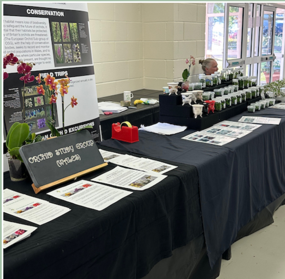
Orchid Study Group from Wales