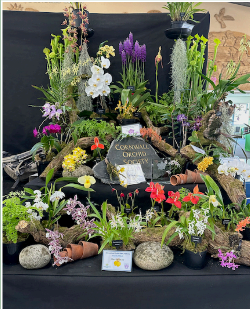
Silver Gilt award Cornwall Orchid Society