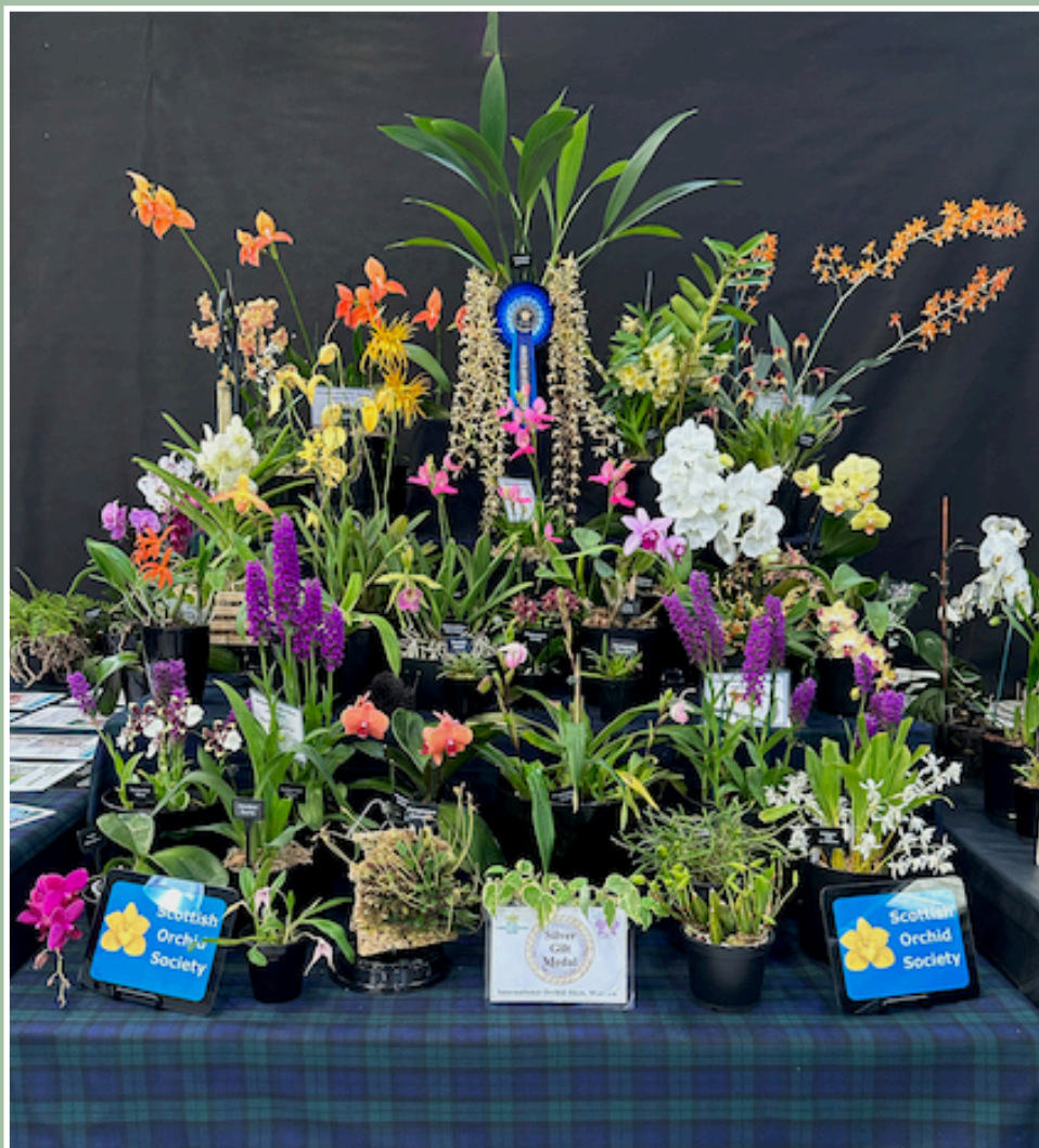
Silver Gilt award Scottish Orchid Society