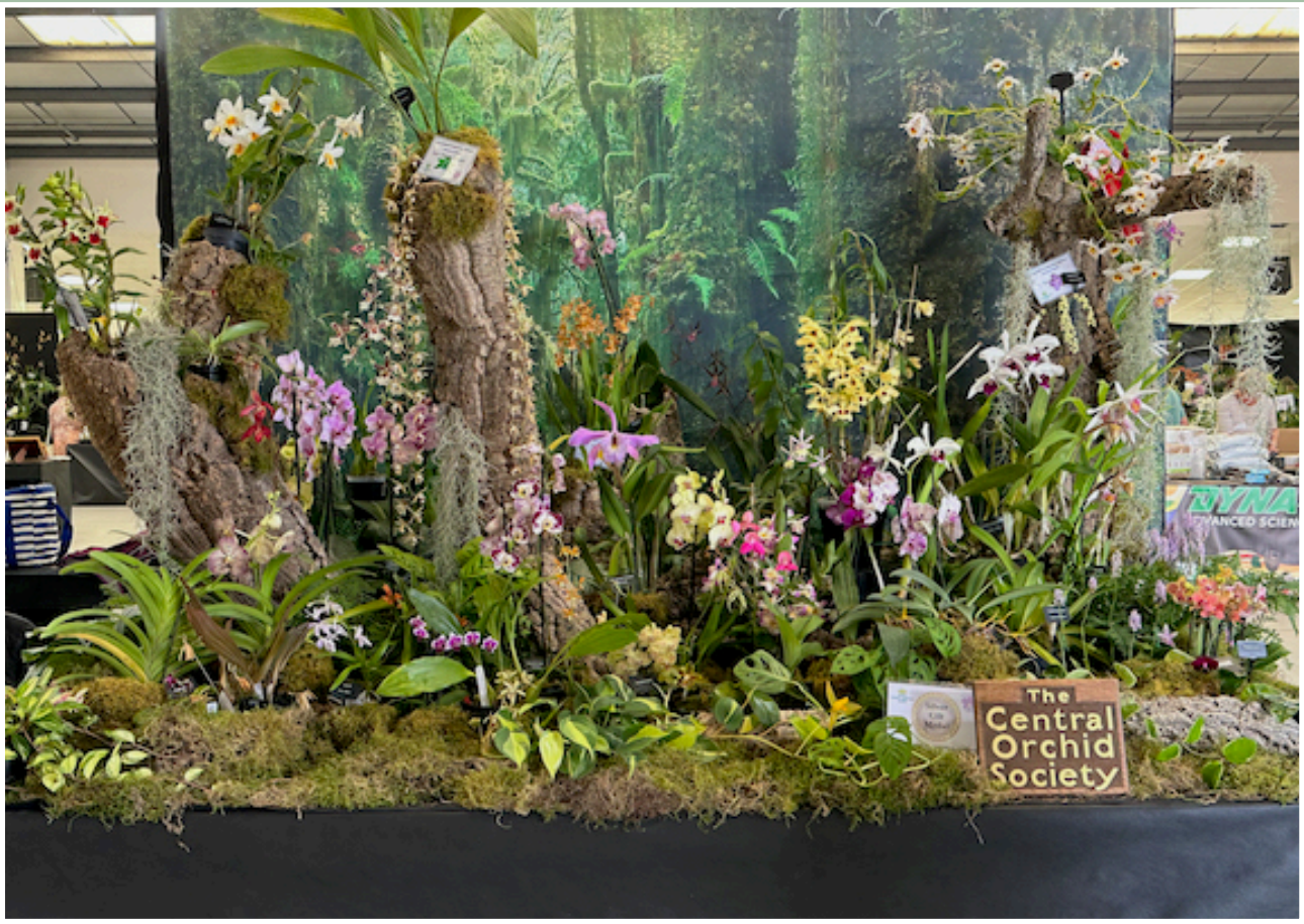
Silver Gilt award Central Orchid Society