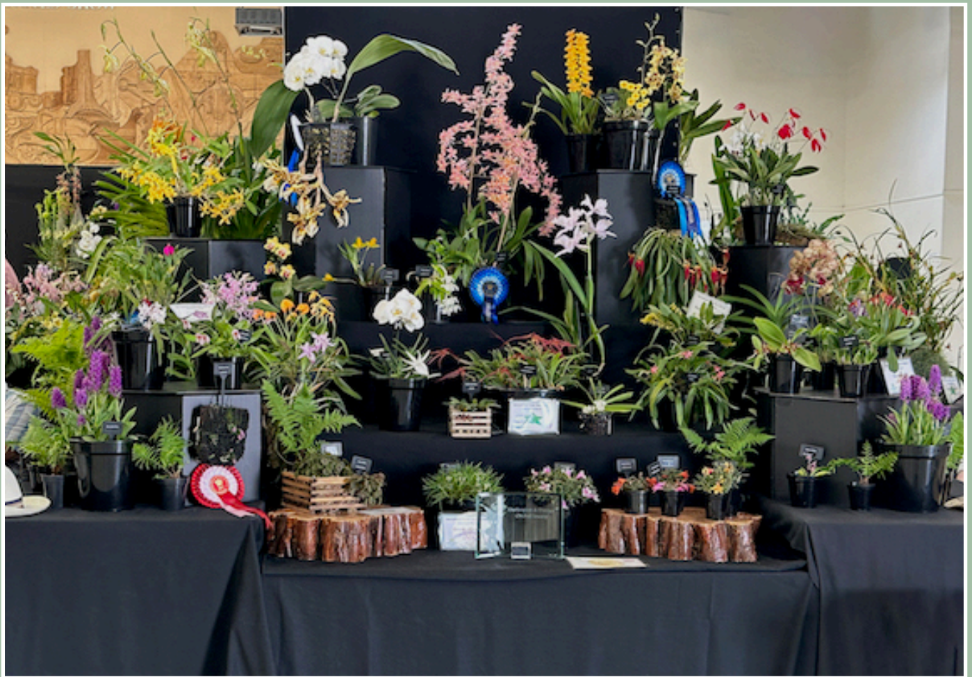
GOLD award Darlington Orchid Society