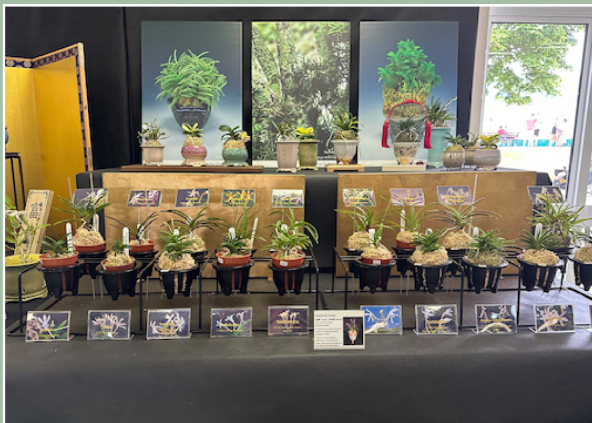
Neofinetia falcata syn. Vanda falcata display in traditional style