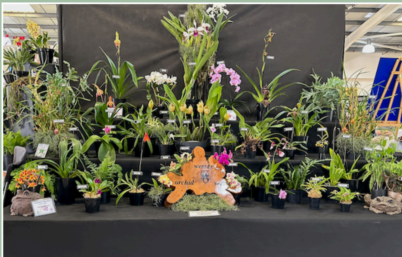
Silver Gilt award Wessex Orchid Society