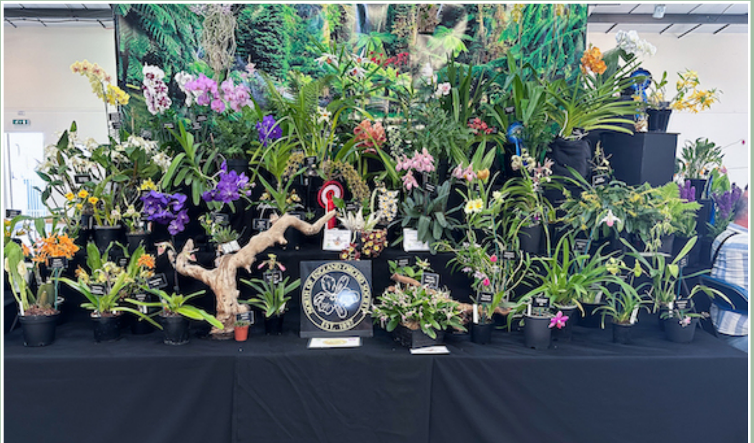
GOLD award North of England Orchid Society