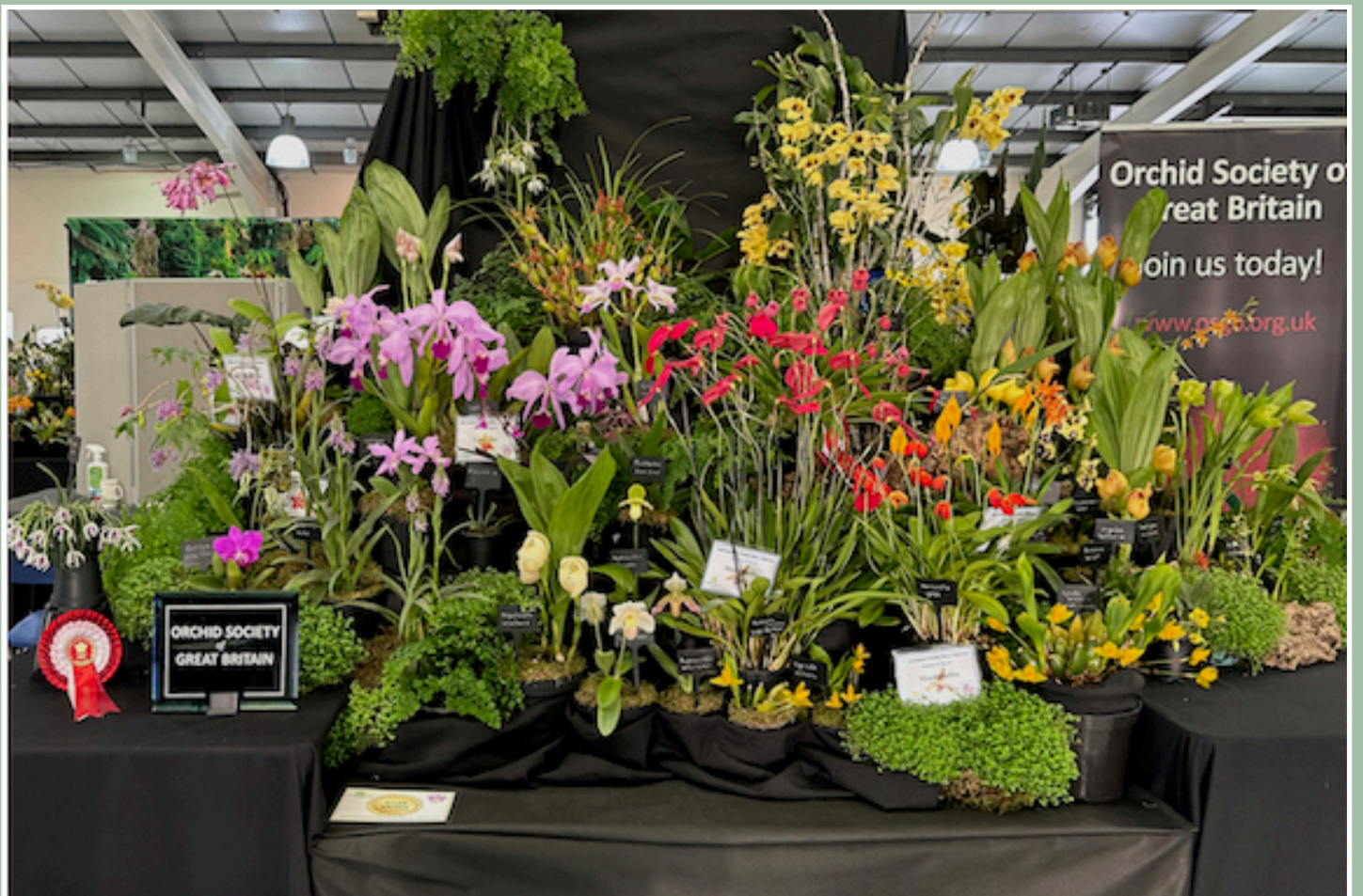
GOLD award Orchid Society of Great Britain