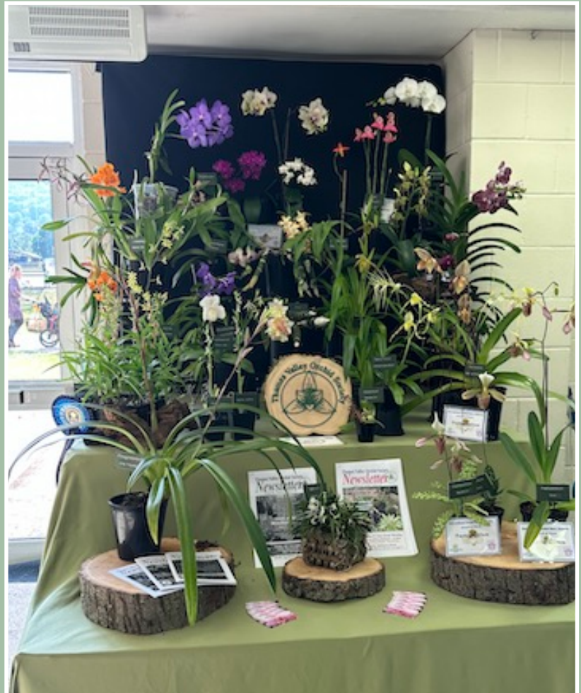
Silver award Thames Valley Orchid Society

But look carefully - the culprit is lurking in the background!