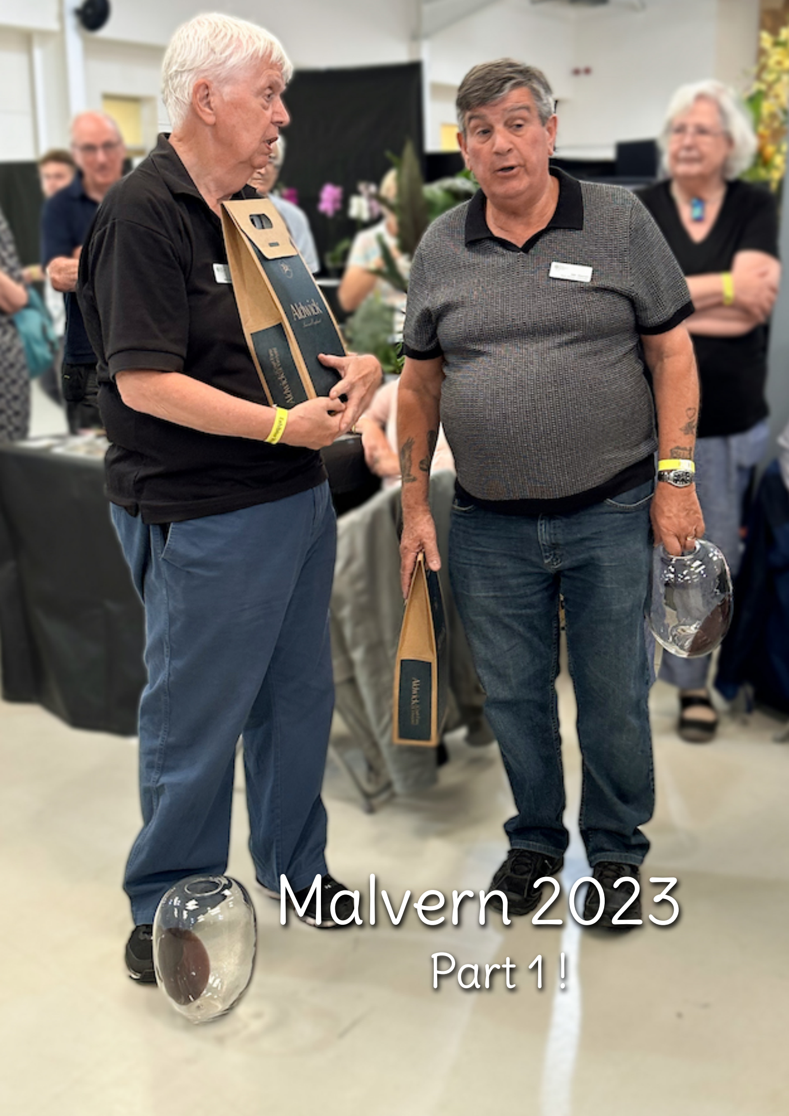
Malvern 2023 Part 1!