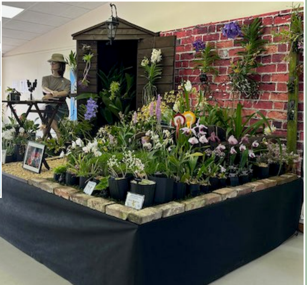
GOLD award Bournemouth Orchid Society

How ever did they get someone to sit there all weekend?