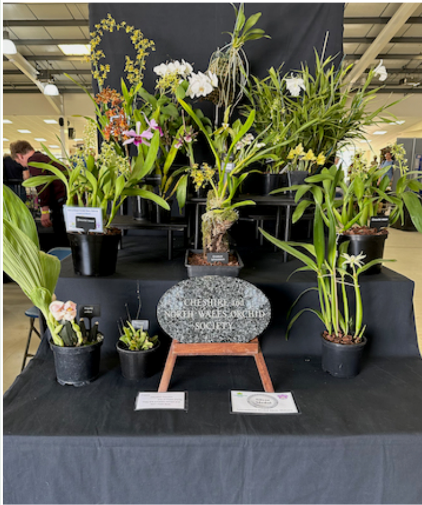
Silver award Cheshire and North Wales Orchid Society