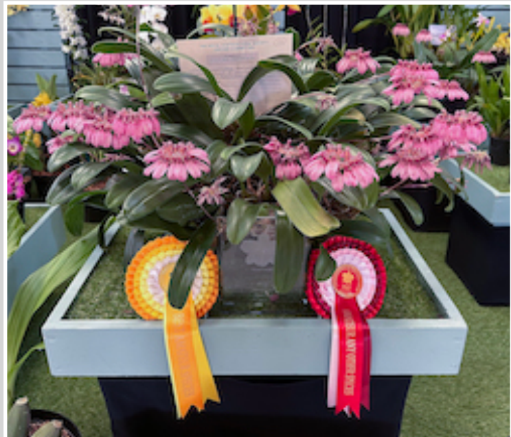
Trophy for Best Amateur Species, RHS Cultural Certificate - Arthur Deakin EMOS