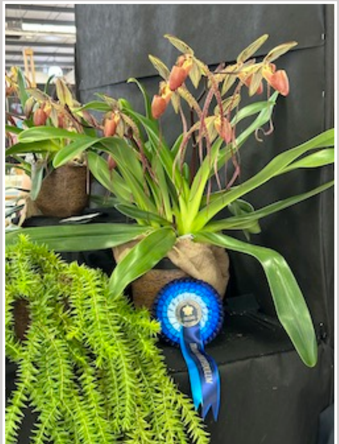
Second trade Paphiopedilum - Spicesotics Paphiopedilum Shin-Yi Williams (different plant)