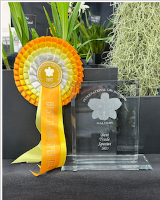
Best Trade Species - Orchid Alchemy Barker spectabilis