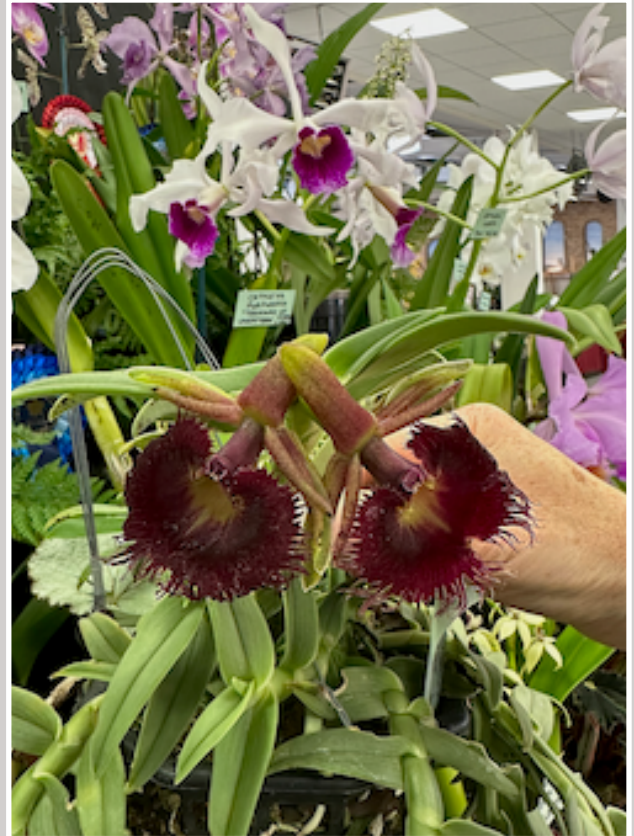
Second Trade Laeliinae - Burnham Nurseries Epidendrum medusae