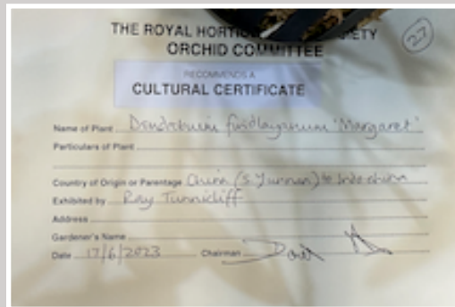
Just in case you wondered what the award card looked like