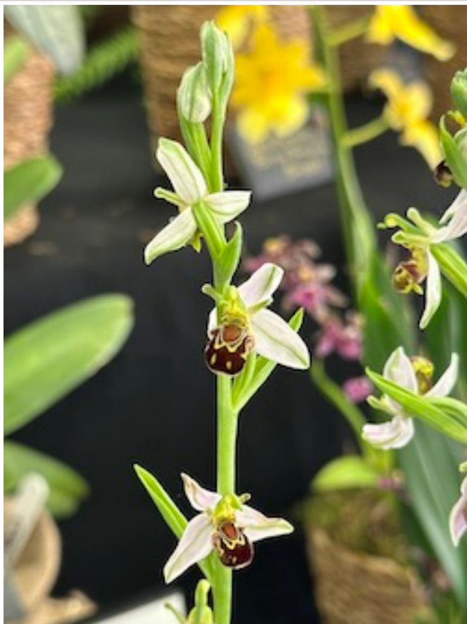
Best Trade Hardy Orchid - Spicesotics Ophrys apifera