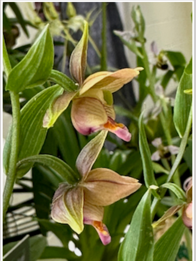
Trade Hardy Orchid second - Orchid Alchemy Epipactis gigantea