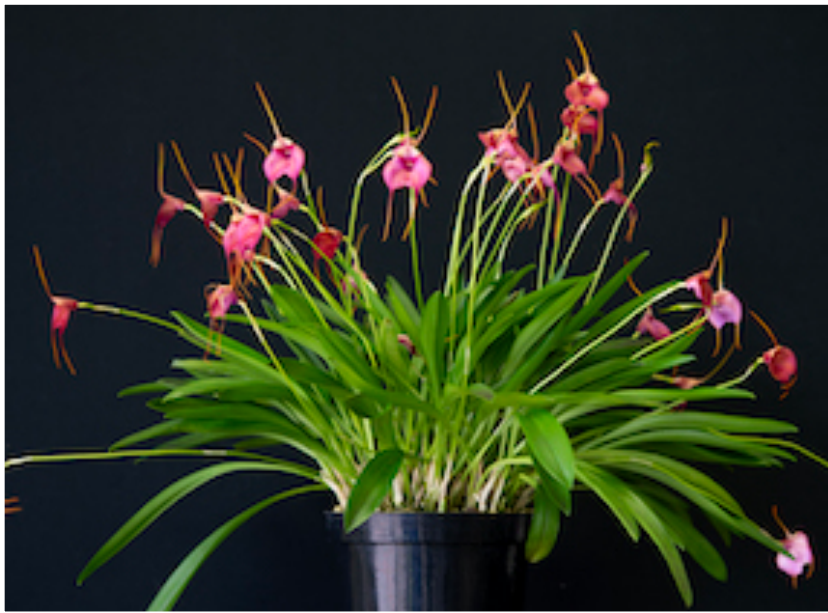
Best Amateur Masdevallia - Malcolm Moodie OSGB Masdevallia Flying Colours