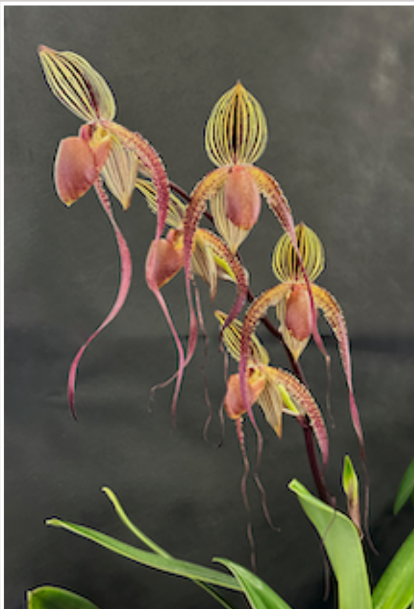
Best trade Paphiopedilum - Spicesotics Paphiopedilum Shin-Yi Williams