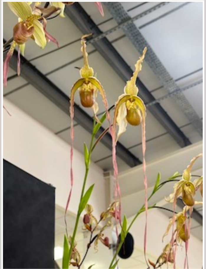
Amateur Phragmipedium second - Hilary Hobbs NEOS Phragmipedium Mont Fallu