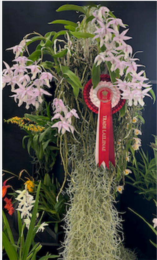
Best trade Laeliinae - Orchid Alchemy Barkeria spectabilis