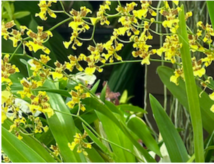
Best Amateur Oncidiinae - B. Gould Bournemouth OS Oncidium sphacelatum