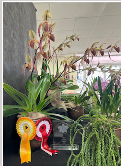
Best Trade Hybrid - Spicesotics Paphiopedilum Shin-Yi Williams