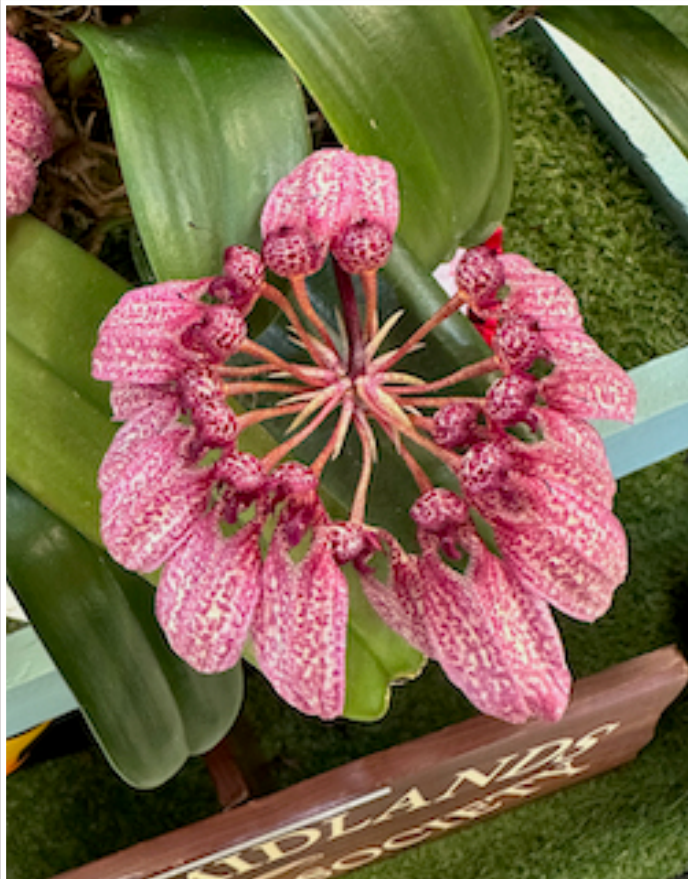
Best Amateur any other species - Arthur Deakin EMOS Bulbophyllum longiflorum