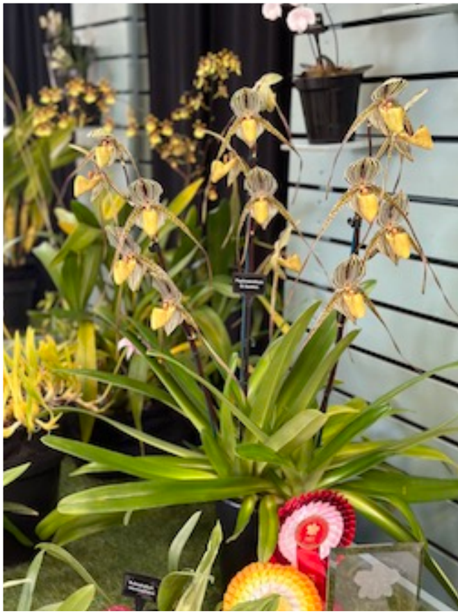
Best amateur Paphiopedilum - Arthur Deakin EMOS Paphiopedilum St. Swithin