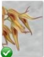
Specklinia picta 'Gigi' flower.jpg

and the name of the species is lower case eg picta