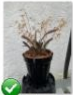
Specklinia picta 'Gigi' plant.jpg

screen shots showing how the example images were saved