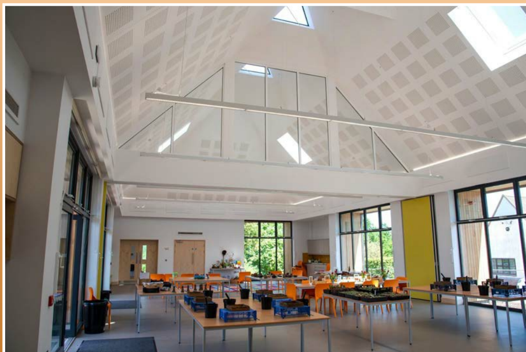
Hyde Hall Clore Learning Centre