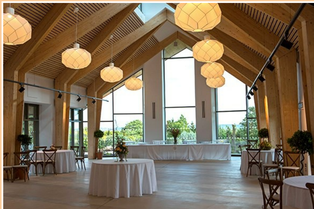
Hyde Hall Hilltop Lodge