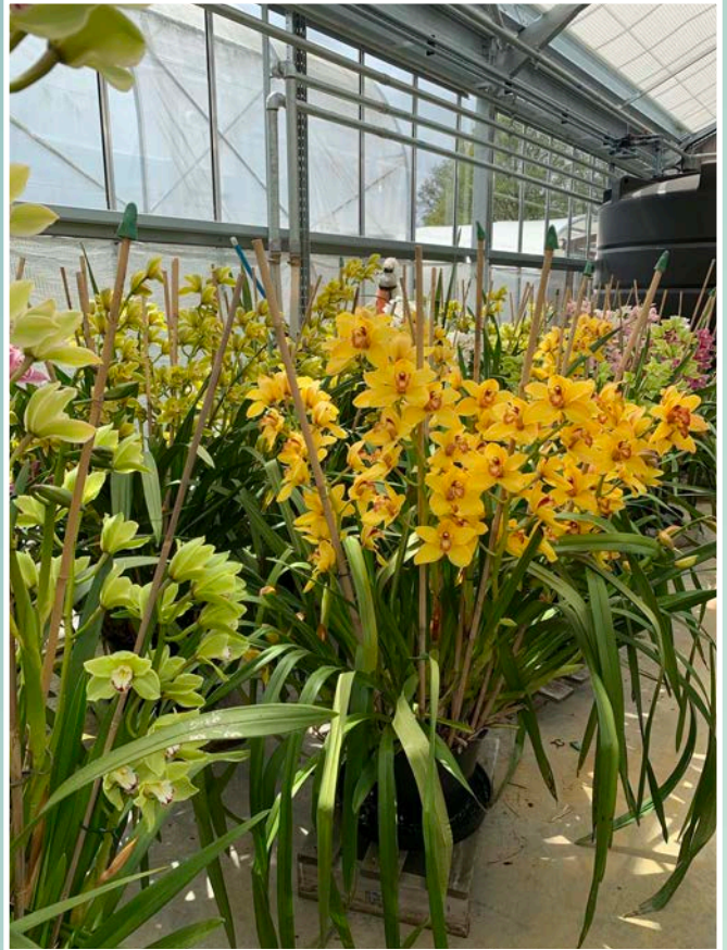
THOSE are what you call Cymbidiums !! But just have a closer look at some of the others - sorry I couldn't get all the varietal names.