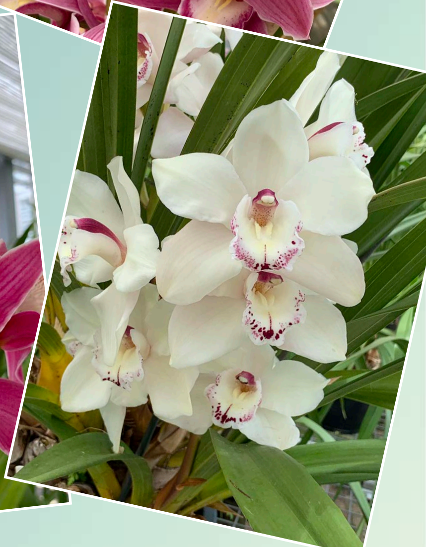
Aren't they beautiful? It's been a while since I have seen standard Cymbidiums like these. Stunning, but too large for my greenhouse or conservatory I'm afraid