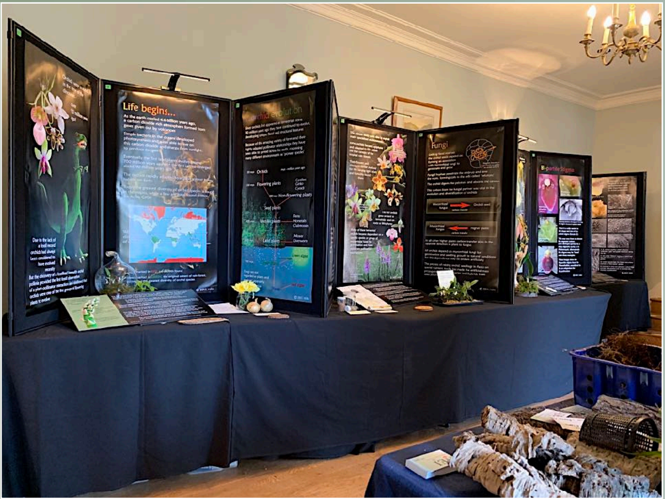
No idea who these people were!!