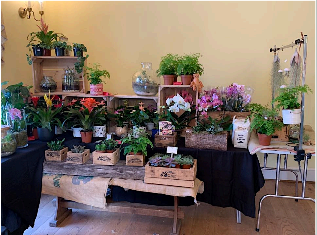
Some very pretty house plants and sundries on sale!