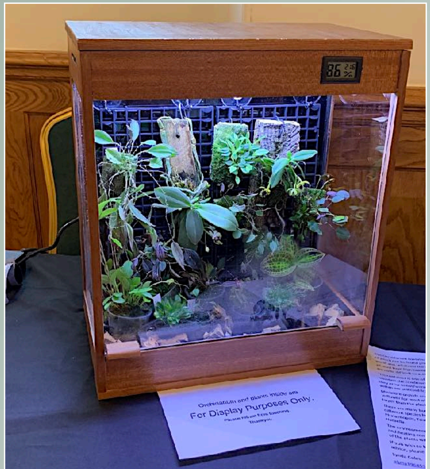
Linda Cole - orchid seedlings and cultivation