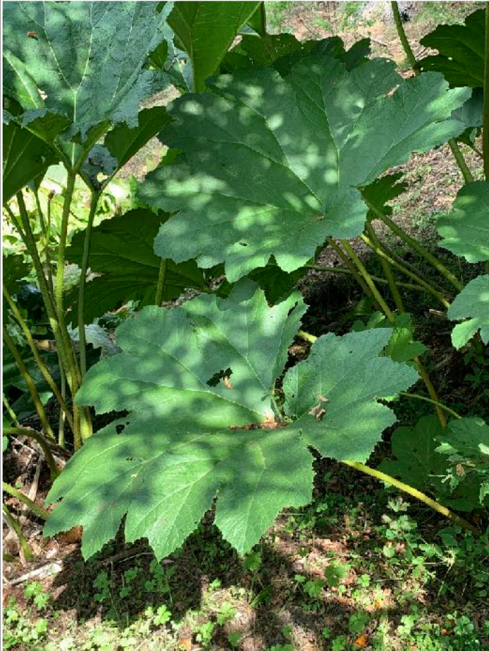
And I found another one! Gunnera manicata - no botanical garden is complete without one!