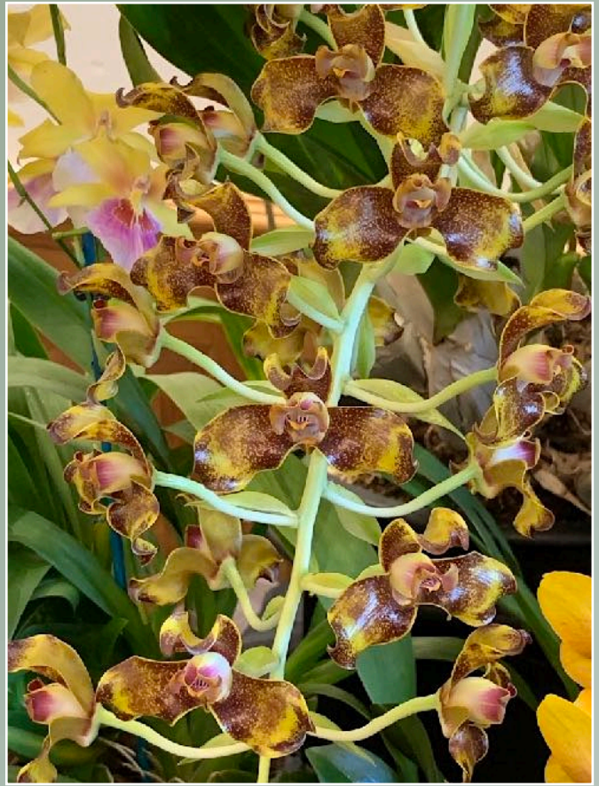
Above and left. I was told this was a Grammatophyllum, so I hope that is right. A very unusual species and one you really don't see that often