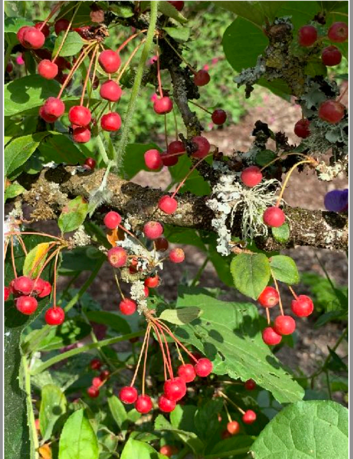
Autumn is upon us - sad but true!