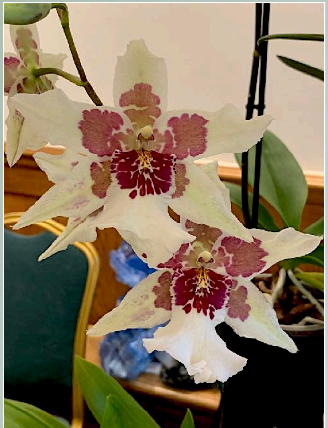
Another couple of gorgeous plants from Devon stand.