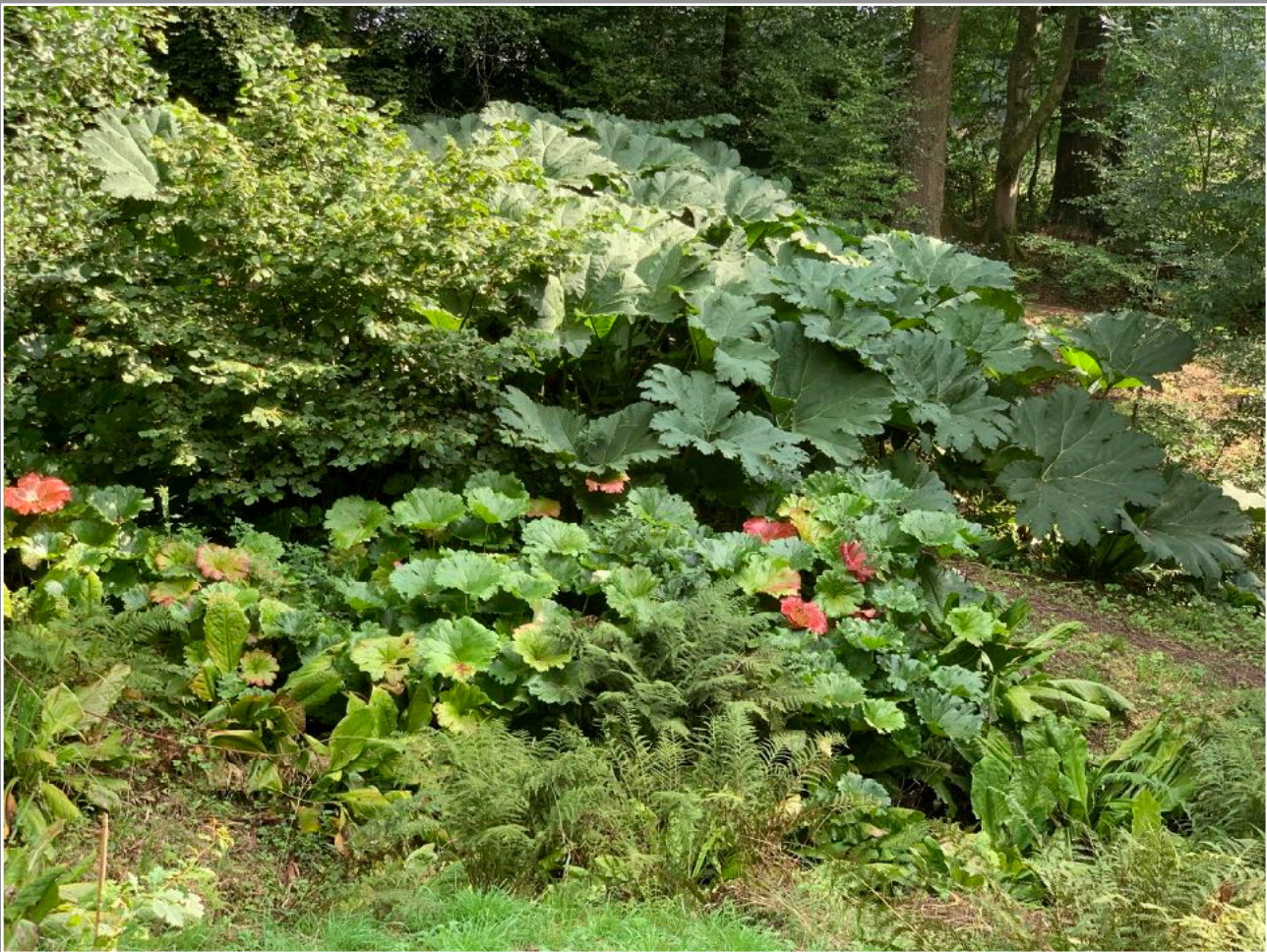
Part of the lovely grounds, with plants in wonderful condition