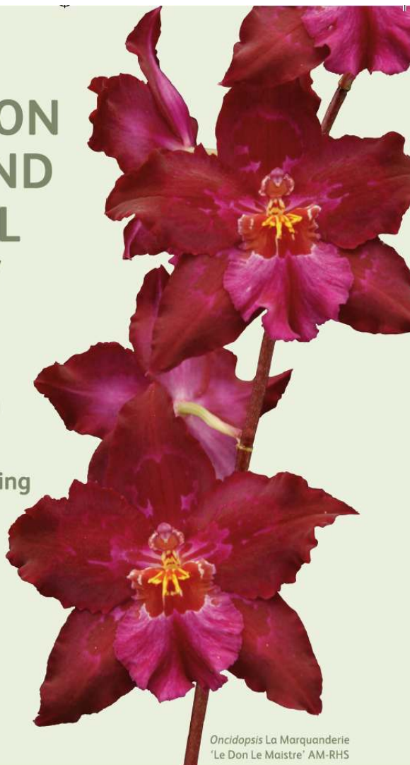
Oncidopsis La Marquanderie 'Le Don Le Maistre' AM-RHS