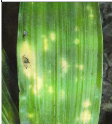
Yellow patches from Boissduval scale

(Please note: The laws for insecticides are changing rapidly and some may be banned.)