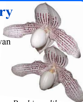
Paphiopedilum In-Charm Maid 'Daya'