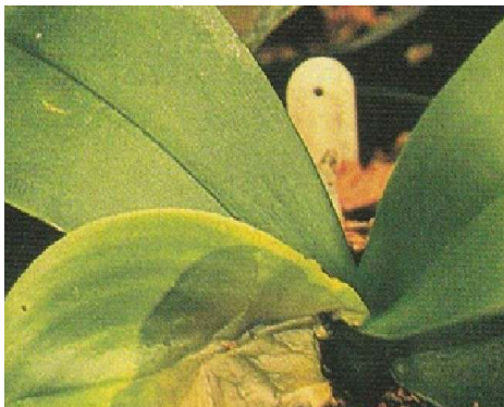
Bacterial rot caused by Erwinia carotovora pv. carotovora and Erwinia chrysanthemi on a phalaenopsis.

Common in collections. Cymbidium mosaic affects 1 in 5 plants and Odontoglossum ringspot 1 in 100. Appearances include brown/black mosaic pattern or chlorotic streaks on leaves. You cannot diagnose by appearance alone, there are many other causes for these symptoms. Plant appears to be in poor condition. Diagnosis is confirmed by an Enzyme-linked immunosorbent assay test (ELISA). Many orchids that carry virus, show no symptoms but can infect other plants. There is no effective treatment, discard or isolate. Virus is not spread by insects (except in masdevallias - infected by aphids). Virus is spread by infected cutting tools, pots etc. Sterilisation of all tools and good greenhouse practice and hygiene is essential. Avoid overcrowding; assume all plants could be infected.