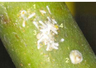
Boissduval scale developmental stages: 1. crawlers, 2. mature females, 3. immature males, 4. mature males