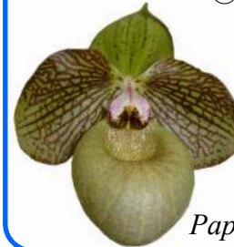
Paphiopedilum fanaticum 'In-Charm'