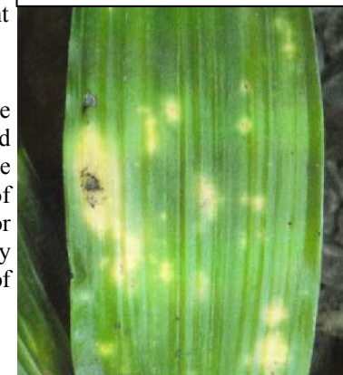
Yellow patches from Boisduval scale

Available insecticides are Bug Clear Ultra (Acetamiprid), Provado Ultimate Bug Killer concentrate (Thiacloprid), and Provado Ultimate Bug Killer aerosol (Thiacloprid and Methiocarb).