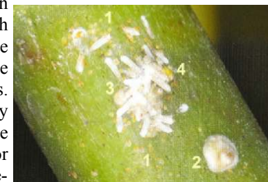
Boisduval scale developmental stages: 1. crawlers, 2. mature females, 3. immature males, 4. mature males