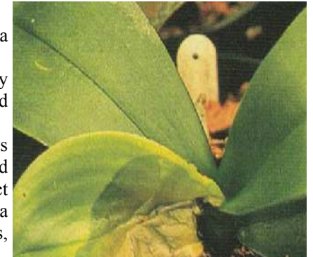
Bacterial rot caused by Erwinia carotovora pv. carotovora and Erwinia chrysanthemi on a phalaenopsis.

Appearances include brown/ black mosaic pattern or chlorotic streaks on leaves. Virus cannot be diagnosed by appearance alone as there are many other causes for these symptoms. Plant appears unhealthy. Diagnosis is confirmed by a laboratory Enzyme – linked immunosorbent assay test (ELISA). Many orchids that carry virus show no symptoms but can infect other plants. There is no effective treatment so discard or isolate. Virus is not spread by insects, except in Masdevallia – which are infected by aphids. Virus spread by infected cutting tools, pots etc. - Sterilisation of all tools and good greenhouse practice and hygiene is essential. Avoid overcrowding, assume all plants could be infected.