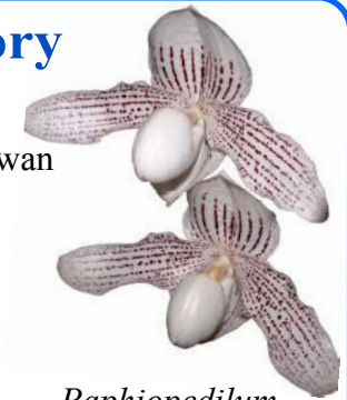
Paphiopedilum In-Charm Maid 'Daya'