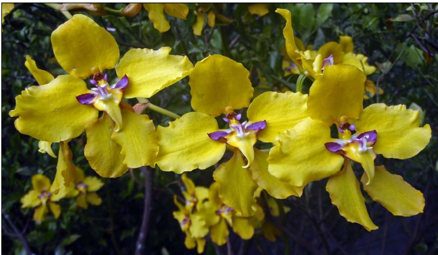
Cyrtorchilum macranthum

There will be two concurrent sessions with simultaneous translation (English -Spanish) for each of the four days of lectures and topics will cover three main sections: science, horticulture, and conservation biology. Two half-day symposiums of invited talks are scheduled and one symposium will be devoted to the vast diversity of Andean orchids, which is what most registrants will see both at the show as well as “up close and personal” on the pre- and post-conference tours. This Andean session, a mini-symposium, will feature speakers from all the Andean nations: two from Colombia (Nhora Ospina, Andrea Niessen), two from Ecuador (Alex Hirtz, Lou Jost), one from Peru (Delsy Trujillo), one from Chile (Mauricio Cisternas), and one covering pollination by euglossine bees (Günter Gerlach). The other symposium will focus on the systematics, ecology, conservation biology,