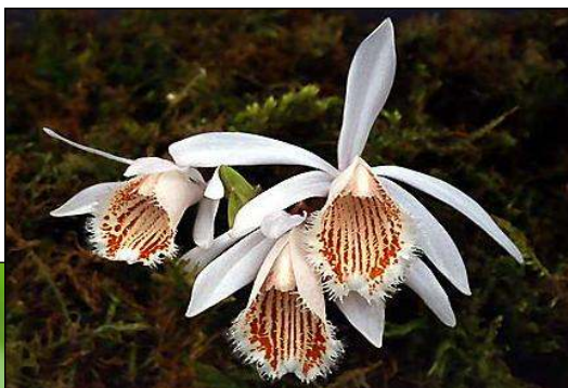
8 th place, Pleione humilis , Sue Sapsard, Wessex OS