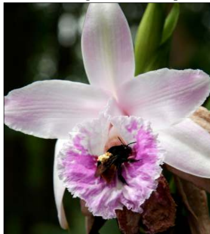
Sobralia rosea & bee pollinator