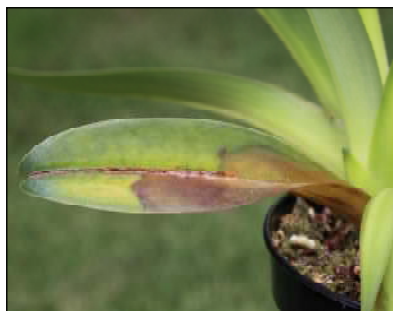
An example of rot found on a Paphiopedilum parishii

These infections spread rapidly and if they reach the crown or the stem can kill the plant. If treated early plants can be saved, so vigilance is essential. Rot appears brown/black, watery and may smell. Infection can become systemic and therefore incurable.