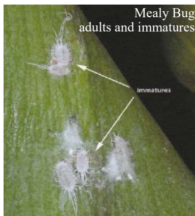
Mealy Bug adults and immatures

Mealy Bug This is a soft scale, a common serious pest resembling a small white woodlouse. It attacks all orchids, especially Phalaenopsis and Paphiophedilum and seriously weakens them. The main signs are fluffy white wax and sooty moulds on leaves. It has a white waxy protective coating and is concealed under leaves, sheaths, flowers and compost. Unlike hard scale it is very mobile and can spread rapidly.