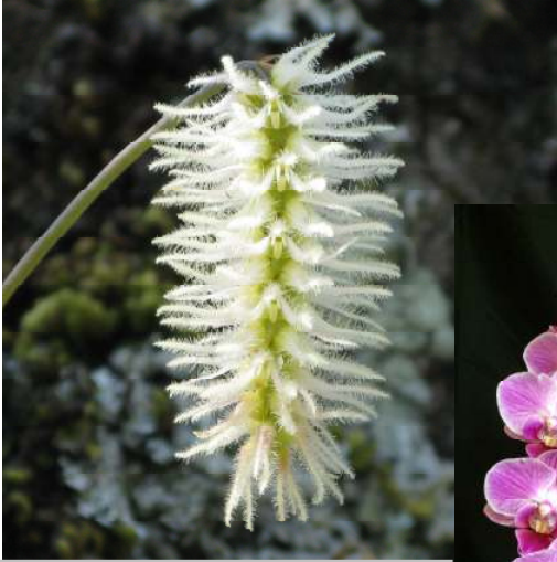
3 rd place: Bulbophyllum comosum Ray Tunnicliff, Central OS

1st place: see front cover 2nd place: see page 26