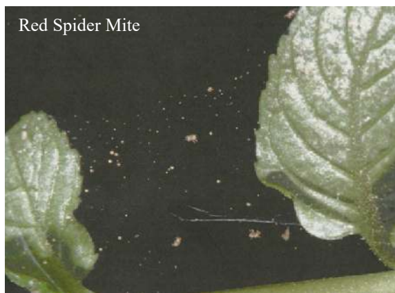
Red Spider Mite