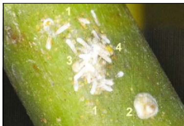
Boisduval scale developmental stages: 1. crawlers, 2. mature females, 3. immature males, 4. mature males