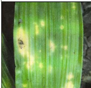
Yellow patches from Boisduval scale

Despite regular scheduling of control methods eradication is often unsuccessful and the only option is disposal of the plant.